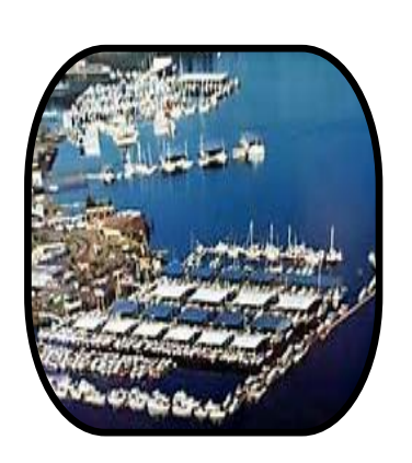
Port Orchard Marina